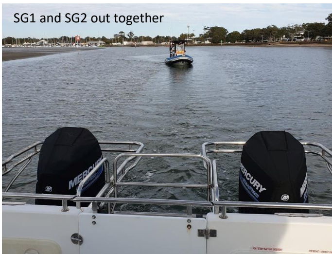
SG1 and SG2 out together