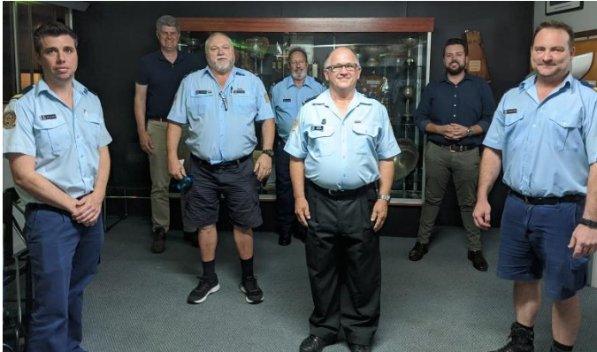
Above: The photo of our 2020/2021 Management Committee and local politicians, socially distanced!