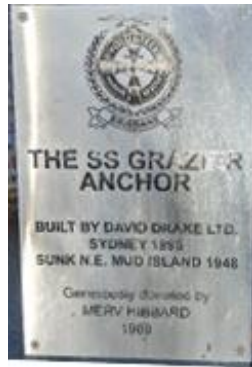
The SS Grazier Anchor Built by David Drake Ltd. Sydney 1896 Sunk N.E. Mud Island 1948.