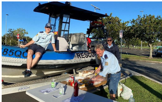
Above: Our volunteers helping out with the Queensland Water Police's Operation Clearwater (p.3)