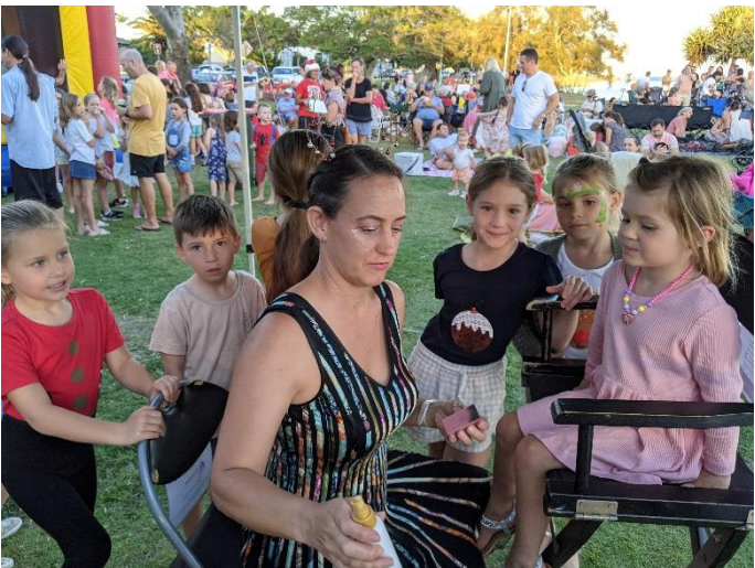
Face painting was popular as was Santa handing out candy canes and glow sticks.