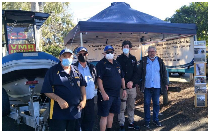
Above: Our volunteers ready to spread the word about boating safety at the Sandgate Einbunpin Festival.