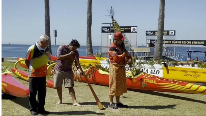
Above: Poly Va'a Ceremony: Blessing of canoes