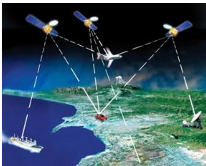
Rescue coordination centre is notified

When the nearest ground station is notified, your distress call is escalated through a local user terminal, mission control centre and then the Rescue Coordination Centre (RCC) responsible in that region for arranging search operations.